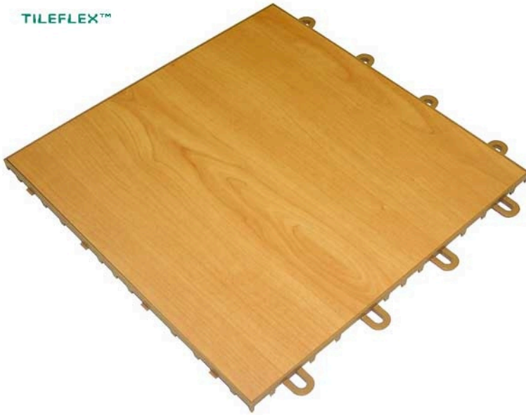
TileFlex Color Chart